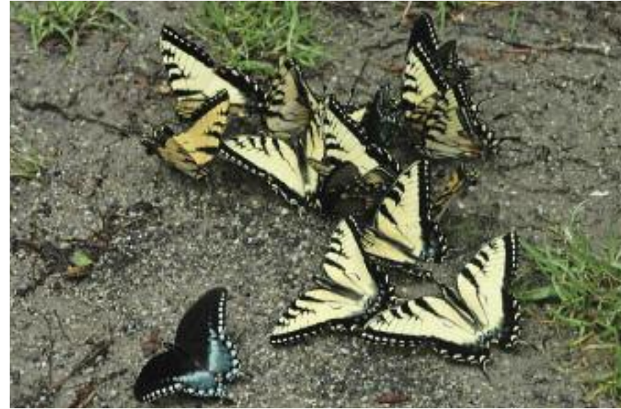
Another way to enhance your garden’s appeal to butterflies is to provide a moist “puddling” site like this one, where they can gather to drink up needed nutrients.

Puddles are another way to offer valuable nutrients. Mostly adult males gather around these wet spots—a behavior known as “puddling.” The nutrients strengthen the male’s sperm, encourage breeding, and improve the viability of the female’s eggs. Much like the highly concentrated nutrients in dried fruit (as opposed to fresh), they become even more