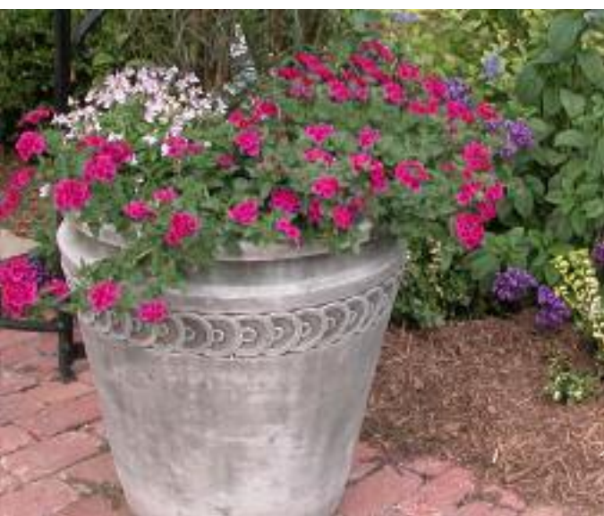
Where garden space is limited, you can grow nectar-rich plants like verbena in containers to attract butterflies.

Kris Wetherbee's garden in Oakland, Oregon, is a haven for butterflies.