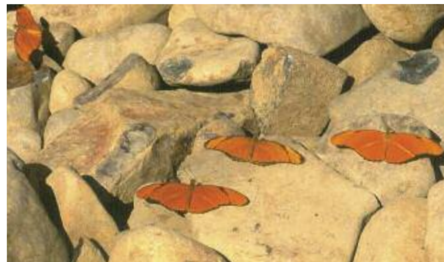
Flatish rocks in a sunny part of the garden offer butterflies a site to bask on cool days.

A windbreak of trees or shrubs will give butterflies a place to hide from the elements and roost at night. An open shed or any nearby evergreen or broad-leaved de-